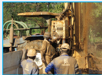
Exploration drilling (left) and environmental water testing (right)